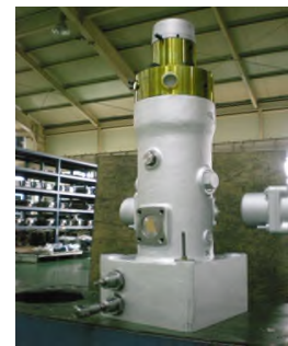
Outlet Pressure: 2000 BAR

And this is why, in test after test, PRI-XL consistently outperforms all others, ensuring that marine fuel pumps will continue to function - whether in normal use, or in mission critical situations.